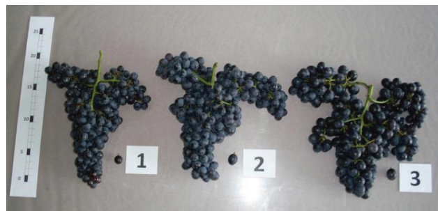
Figure 1. The Gobbi Gib 2LG influence on the external appearance of the bunch and berries. The Beauty seedless variety, (Italian technology). The variant of experience: 1-Control - H 2 O; 2-GG2LG -3.6 l/ha; 3-GG2LG-4.6 l/ha

The quantity of berries is equal to the control. At the same time the grain characteristic value increases and so the weight of a 100 grains increases up to 1.5 (GG2LG-3.6 l/ha) - 1.7 (GG2LG-4.6 l/ha). Within these terms the harvest data increases up to 2.3-2.6 kg/vine. The sugar content is at the same level as that of the control, or may even be a little higher but it is to be mentioned that decreases the level of the titratable acidity (Table 1, Figures 1, 2).