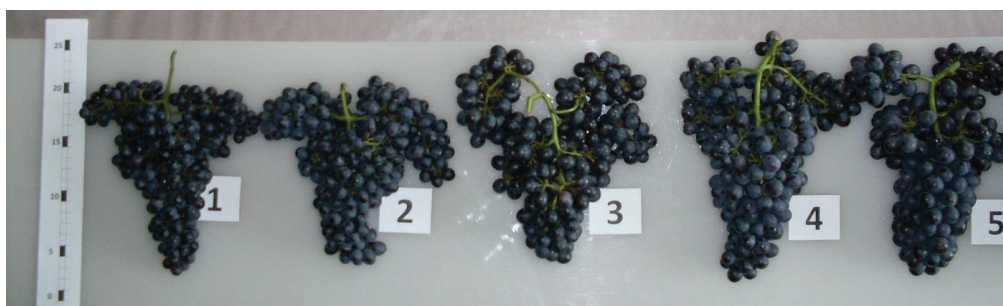
Figure 5. The Gobbi Gib 2LG influence on the external appearance of the bunch and berries. The Beauty seedless variety, “Terra vitis” Ltd., 2013. The variant of experience: 1-Control-H 2 O; 2-GG2LG -3.6 l/ha; 3-GG2LG-4.6 l/ha, (Italian technology); 4-GG2LG-2.0 l/ha; 5-GG2LG-2.4 l/ha (Moldova technology)

Thus, it can be said that the use of Gobbi Gib 2LG, leads as to an increase of cluster productivity up to 1.6-1.7 (Italian technology) and to 1.8-2.0 times (Moldova technology) indifferent the ways of applications and concentration as well as to the quality production modification. Data analysis gives us a reason to recommend the use of the Gobbi Gib 2LG within seedless variety as an obligatory process within their harvest in the Republic of Moldova.