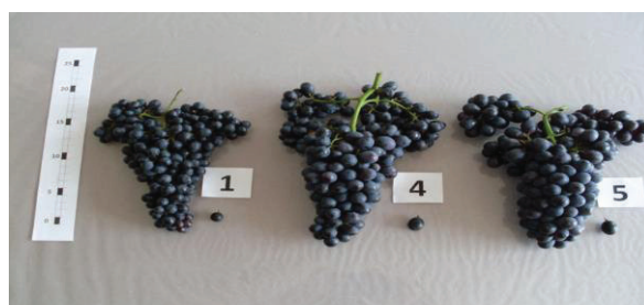
Figure 3. The Gobbi Gib 2LG influence on the external appearance of the bunch and berries. The Beauty seedless variety, „Terra vitis” Ltd., 2013, (Moldova technology). The variant of experience: 1-Control - H 2 O; 4-GG2LG - 2.0 l/ha; 5- GG2LG - 2.4 l/ha

Inside the grains there was a inconsiderable fell down of the composition of the dry matter (sugar), and the titratable acidity rate was not higher than that of the control.