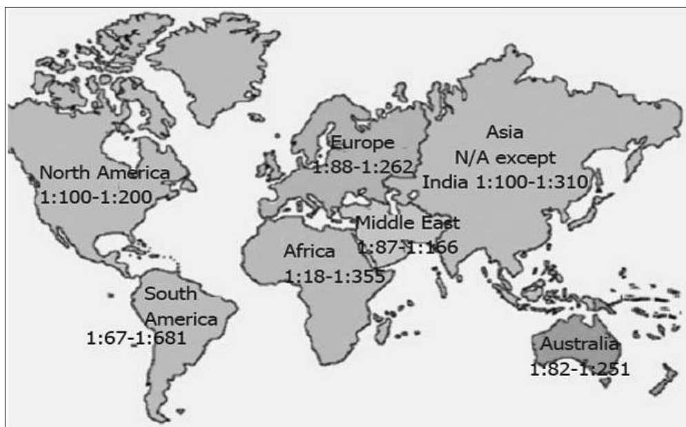
Fig 1. Prevalence of celiac disease worldwide, World J Gastroenterol. 2012 Nov 14; 18(42): 6036-6059.

Australia and New Zealand are two countries that have the highest percentage of people of Caucasian origin, with a high prevalence of wheat consumption per capita of more than 150 kg [13]. Only two preva-