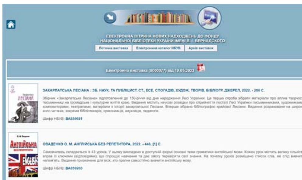
Fig. 3. Fragment of the „Electronic Showcase of New Arrivals to VNLU Collection”

Fig. 3 illustrates a fragment of a typical electronic exhibition from the „Electronic showcase of new arrivals to VNLU Collection”.