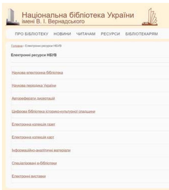
Fig. 1. Fragment of the web page „Electronic Resources of VNLU”

A segment of the „Electronic Resources of VNLU” webpage is presented in Fig. 1. Access mode: http://www.nbuv.gov.ua/node/2116 .