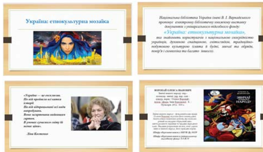
Fig. 4. Fragments of the book trailer „Ukraine: Ethnocultural Mosaic”

Fragments of the book trailer „Ukraine: Ethnocultural Mosaic” are presented in Fig. 4.