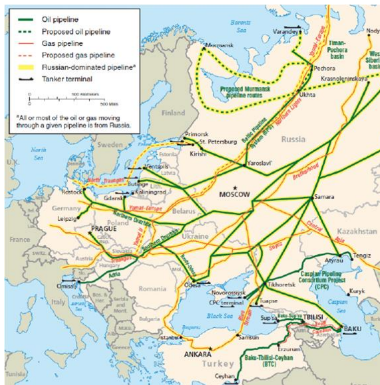
Figure 1. Scheme of existing oil and gas pipelines from Russia on the territory of Europe

Natural gas, unlike oil, is not sold on the world market and is almost never delivered by tankers, for this reason the change of the gas supplier in the immediate future is an extremely difficult objective. At the moment, neither Europe nor other countries are ready to increase natural gas production, and its strategic reserves practically do not exist.